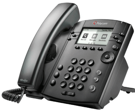
Polycom VX 300 6 line, Monochrome screen for utility applications