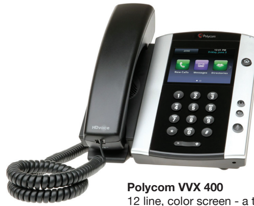
Polycom VX 400 12 line, color screen - a terrific mid-range device