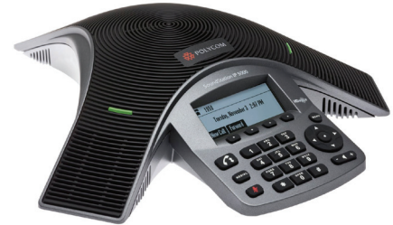
Polycom IP 5000 Premium conference room phone – ideal for mid-sized applications

Metaswitch features Polycom IP phones to power your business. Polycom is known industry-wide for its superior voice quality and handset design.