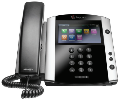
Polycom VX 500 12 line, with a large color screen – perfect for executives