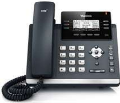
YealinkSIP-T42G 12-Line/15-Key GigE