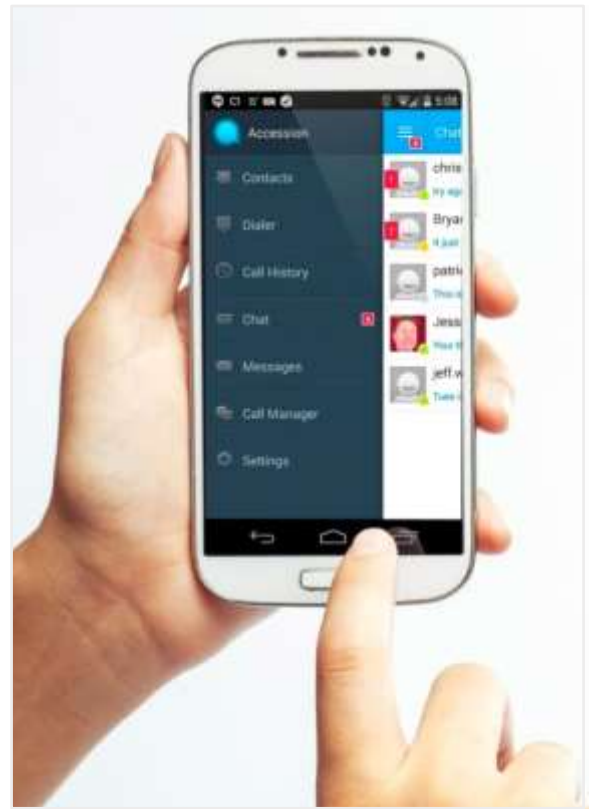
Accession Mobile makes it easy to stay connected when you're on the go.

With Hosted PBX, IP Communications delivers a best-in-class phone system that allows you to buy only what you need. We take care of the details – phones, equipment, installation, training, and ongoing service – so you can focus on your business. Best of all, we're local and available around the clock to help solve any problems you might have.