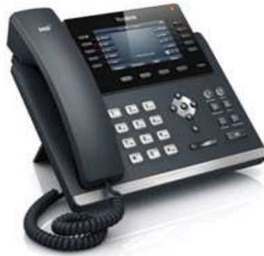
YealinkSIP-T46G 12-Line/27-Key GigE-Color