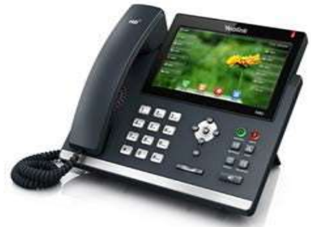
YealinkSIP-T48G 16-Line/29-Key GigE-Color

IP Communications features Yealink IP Phones to power your business.